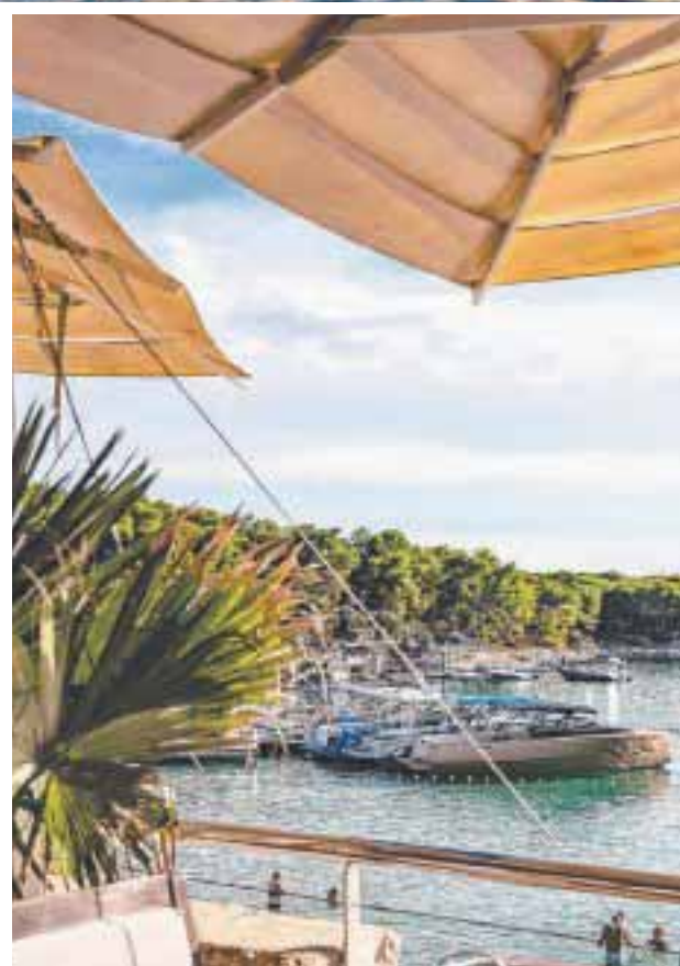
From top: Waking up to a still morning in a quiet bay; the resort island of Hvar; crewmate Mary Beth unfurls the jib; view from Toto's in Palmizana; Konoba Luviji Rooftop.